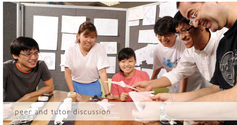
peer and tutor discussion